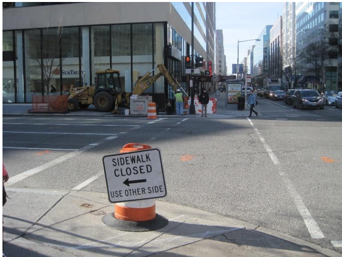
Sidewalk closure on M Street between 18 th Street and Connecticut Avenue