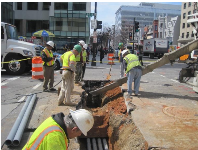
Concrete pouring on top of electrical conduit