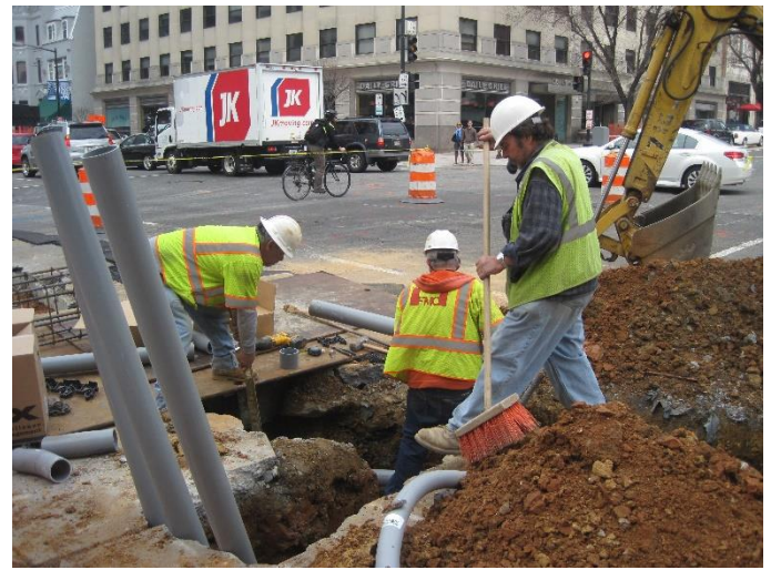
Installation of electrical conduit and pipes