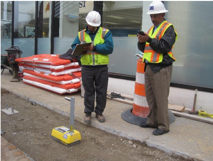
Density test performed by DDOT Technician

Project Website: www.connecticutavestreescape.com