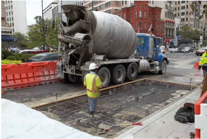
Concrete pour for the new bus pad located along the southbound lanes at the intersection of Rhode Island and Connecticut Avenue