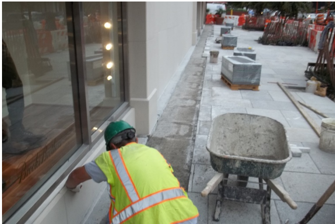
Placement of brick pavers, against the Brooks Brothers business and along the sidewalk beside of Rhode Island Avenue