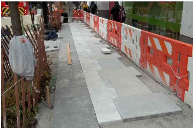
Sidewalk paver installation in front of the 1300 block along the southbound side of Connecticut Avenue