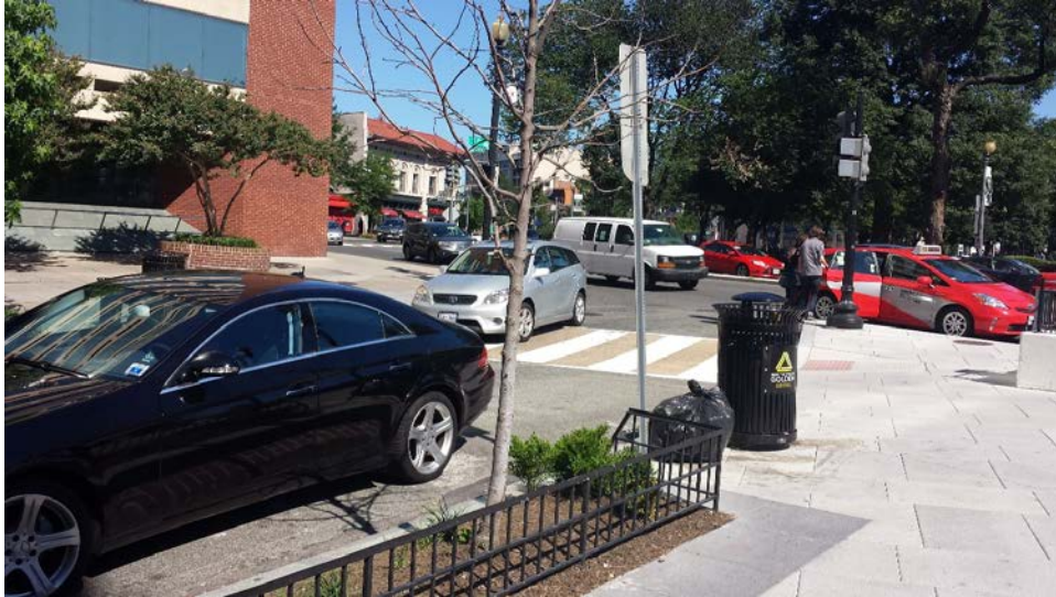
Newly striped pedestrian crossing, tree box fencing, and mulched planter bed located at the southern portion of DuPont Circle and 19 th Street.