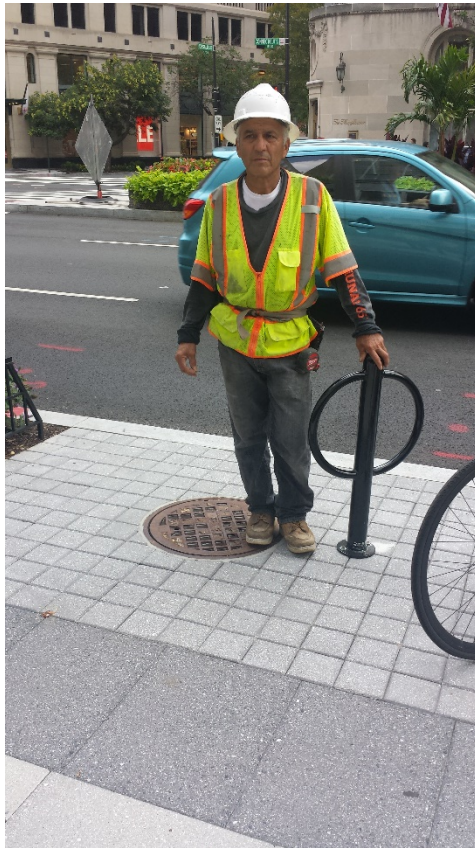
Fort Myer construction crews installing bike racks along several areas of the Connecticut Avenue construction project.