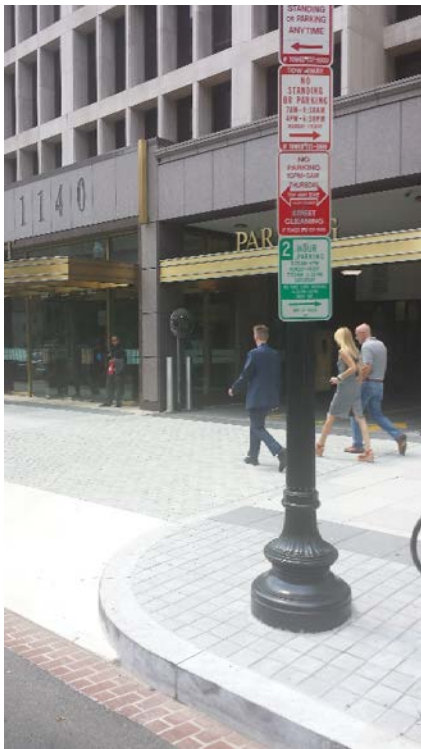
New light poles and signage located throughout the construction site.

Project Website: www.connecticutavestreetscape.com