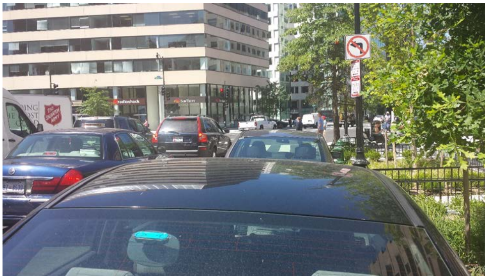
Traffic signals and signage help in aiding vehicular traffic along the intersection of M Street, Connecticut Avenue, and Rhode Island.